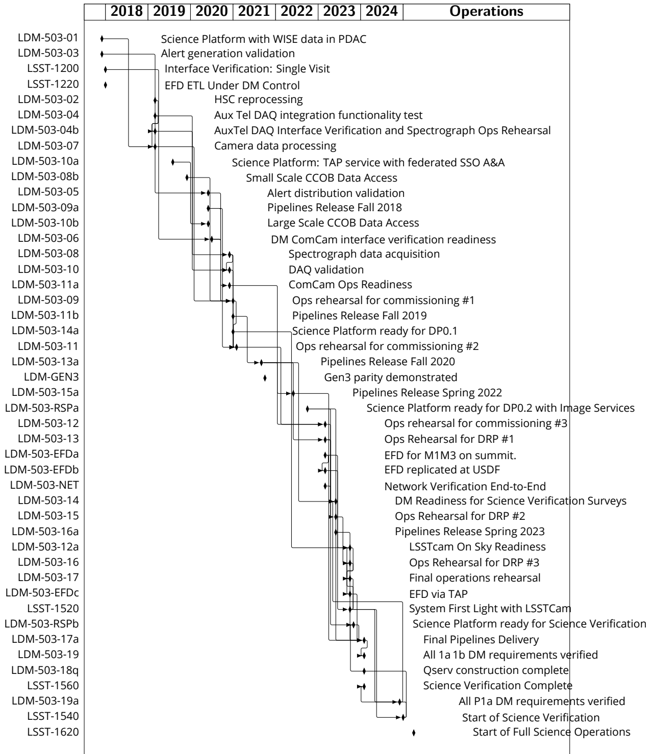
FIGURE 4: DM major milestones (LDM-503-x) in the LSST schedule. See also the replan schedule(??).